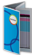
Double parallel Fold