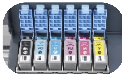
The 6-colour printing process leads to enhanced colour precision and greater tonal depth.