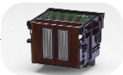
Canon's ingenious 1" wide print head ensures outstanding colour quality and print speed.

The W6200P offers standard support for Windows and Mac environments via a multi-interface, so that it fits seamlessly into your network platform. To increase total throughput even further, optional interface boards enable USB 2.0 Hi-speed or IEEE 1394 support. A wide array of utilities are available to enhance productivity - including Canon's NetSpot® Suite software which enables integrated management of every printer connected to your network.